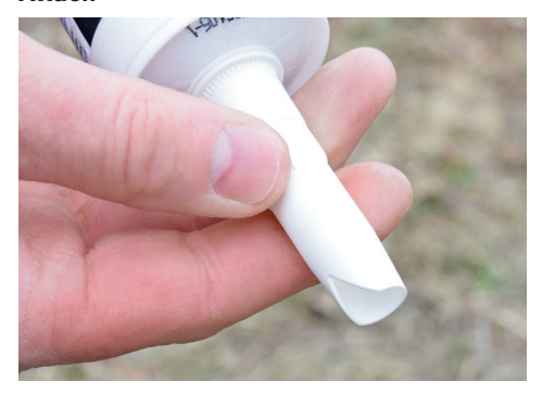
Apply (v-notch up at 90°)