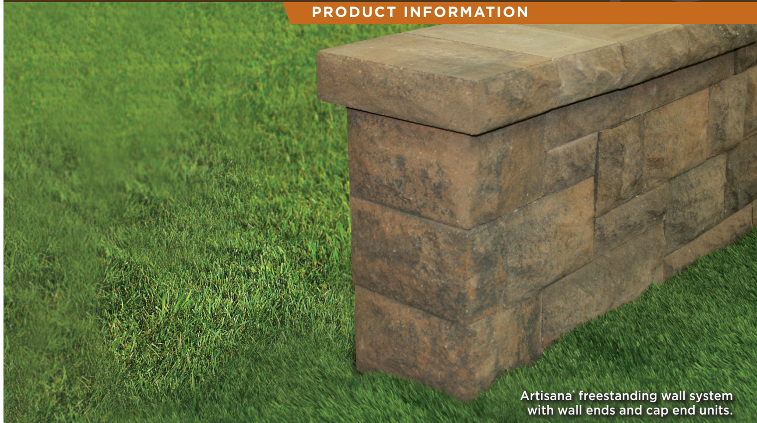
Artisana ® freestanding wall system with wall ends and cap end units.

New accessories are now available for the Artisana ® wall system, a design inspired by hand-worked stone. Three-sided cap end unit and wall end units save installation time, minimize cutting and improve aesthetics, compared to other options for ending a wall in a multiheight or 6-inch multipiece system.